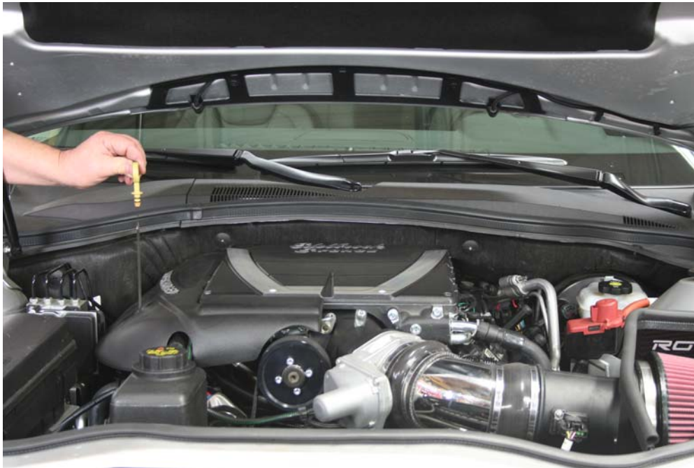
Step 1: Remove engine covers.