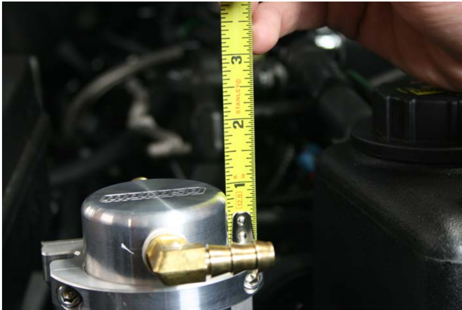
Step 15: Set height as shown from 1" to 1 1/8".