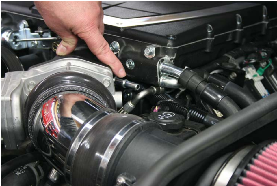
Step 3: Locate nipple on intake behind throttle body.

For Technical Assistance, call Moroso's Tech Line (203)-458-0542, 8:30am-5:00pm Eastern Time MOROSO PERFORMANCE PRODUCTS, INC.