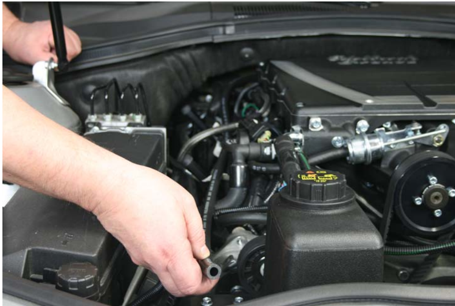
Step 6: Finish routing other end of hose to front of vehicle.