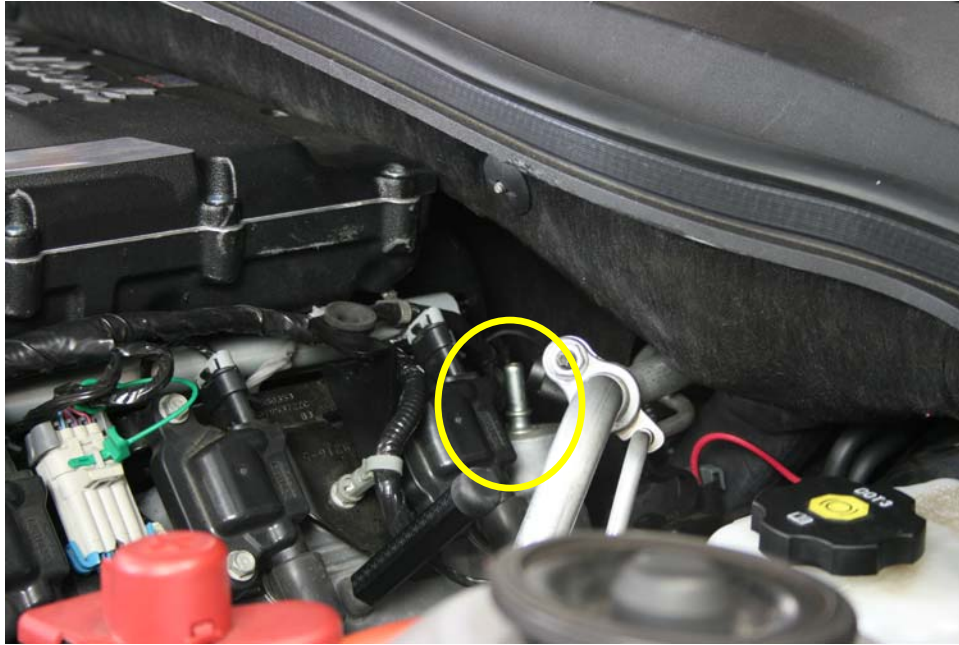
Step 2: Locate PCV nipple on driver's side rear valve cover.