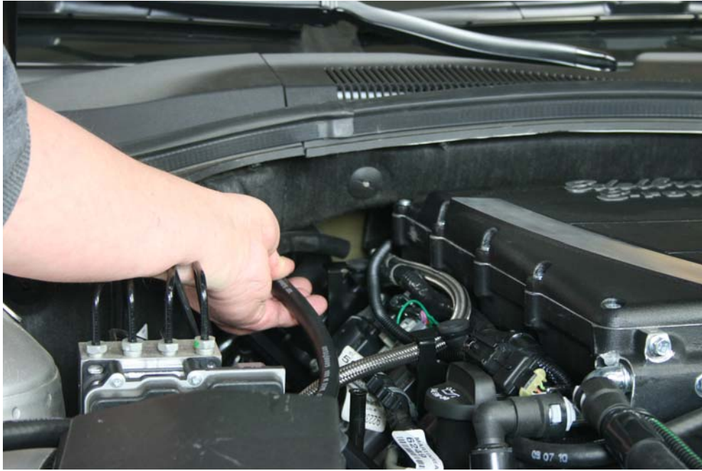
Step 4: Route 56" length of hose around back of engine to PCV nipple on valve cover.