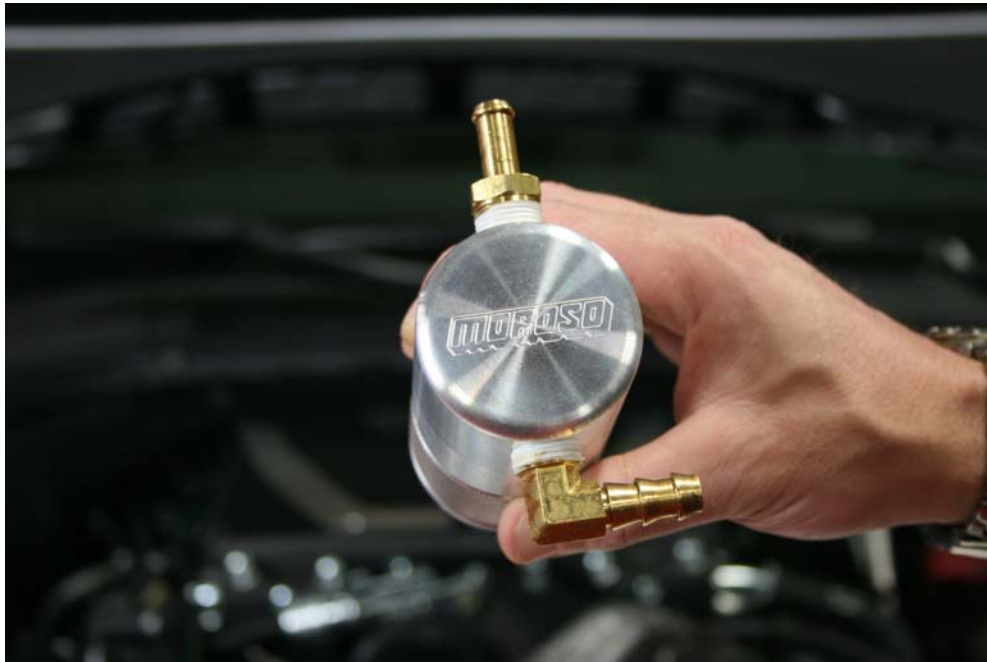
Step 9: Install fittings as shown using Teflon Tape.