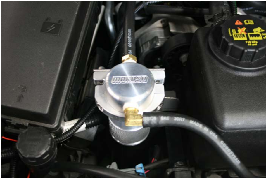
Step 16: Install 3/8 hoses to barbed fittings

For Technical Assistance, call Moroso's Tech Line (203)-458-0542, 8:30am-5:00pm Eastern Time MOROSO PERFORMANCE PRODUCTS, INC.