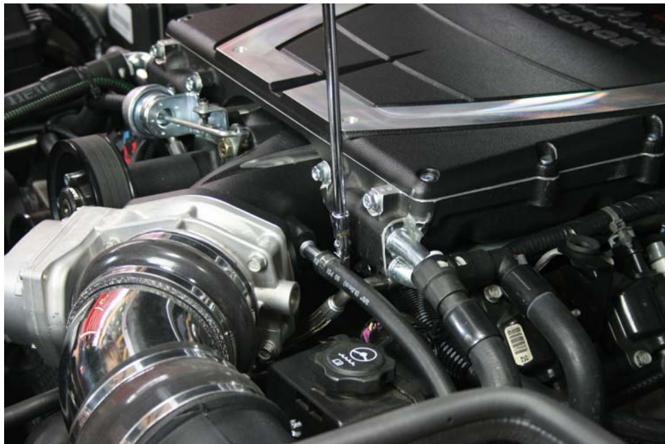
Step 7: Install 48" length of hose to intake nipple using hose clamp. For Technical Assistance, call Moroso's Tech Line (203)-458-0542, 8:30am-5:00pm Eastern Time MOROSO PERFORMANCE PRODUCTS, INC.