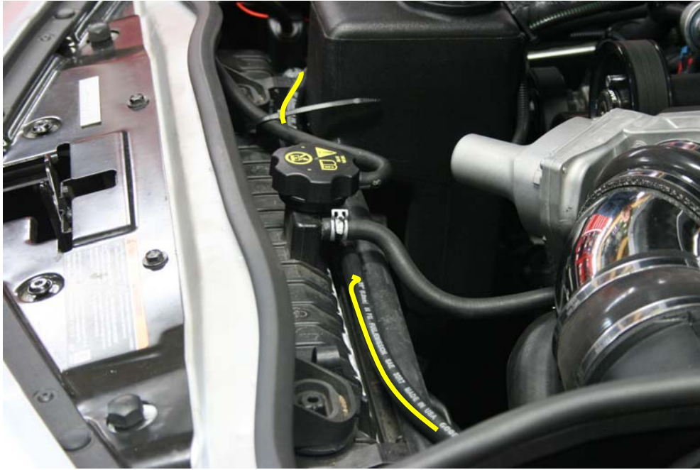
Step 8: Route hose as shown to other side of expansion tank.