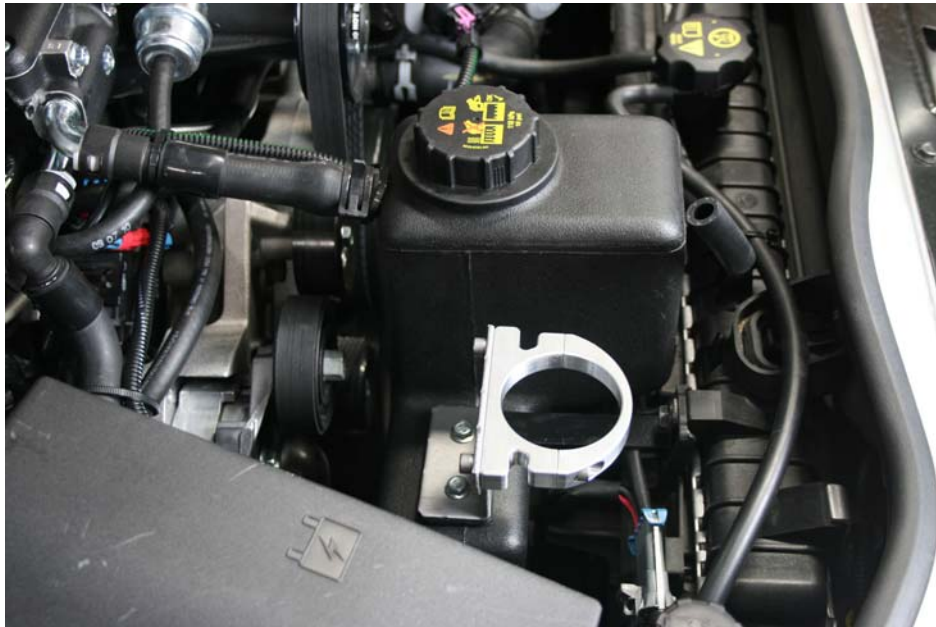
Step 13: Install mounting bracket using hardware previously removed.