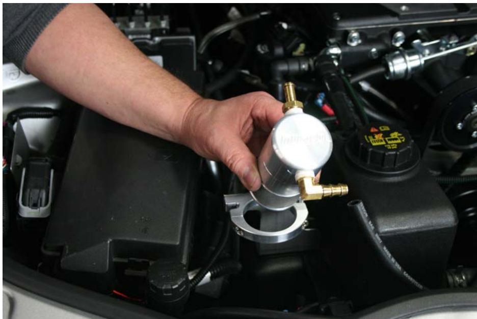
Step 14: Insert Air Oil Separator into billet clamp.

For Technical Assistance, call Moroso's Tech Line (203)-458-0542, 8:30am-5:00pm Eastern Time MOROSO PERFORMANCE PRODUCTS, INC.