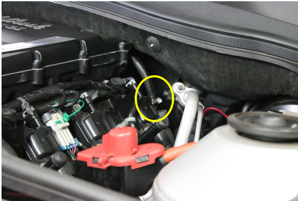
Step 5: Install hose using hose clamp.

For Technical Assistance, call Moroso's Tech Line (203)-458-0542, 8:30am-5:00pm Eastern Time MOROSO PERFORMANCE PRODUCTS, INC.